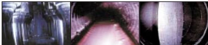
Reactor Head CRDM - Weld Inspection

All of the crawlers and cameras can be connected to each other and the cable with the simple twist of this T-bar tool.