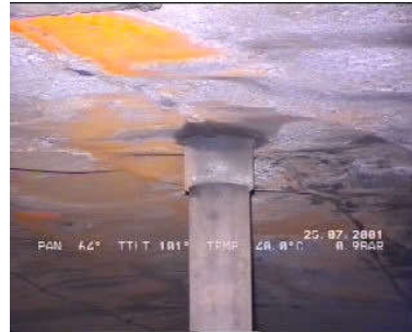
Roof Distorted at Support