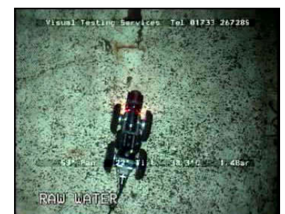
VTS Crawler Submerged