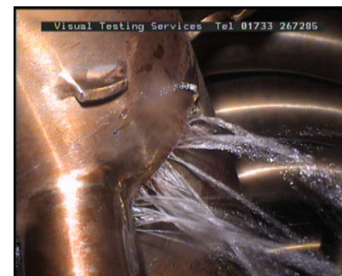
Heating Coil Leak