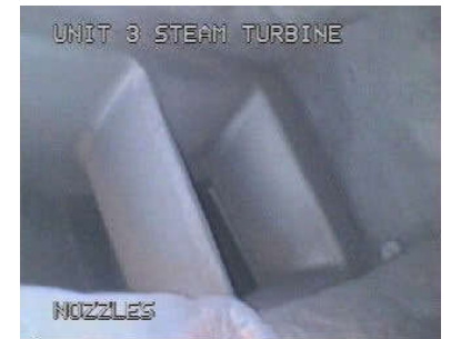
Nozzles inspected @ 300deg C