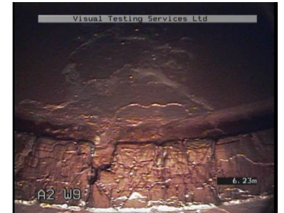
Backing Ring Deterioration